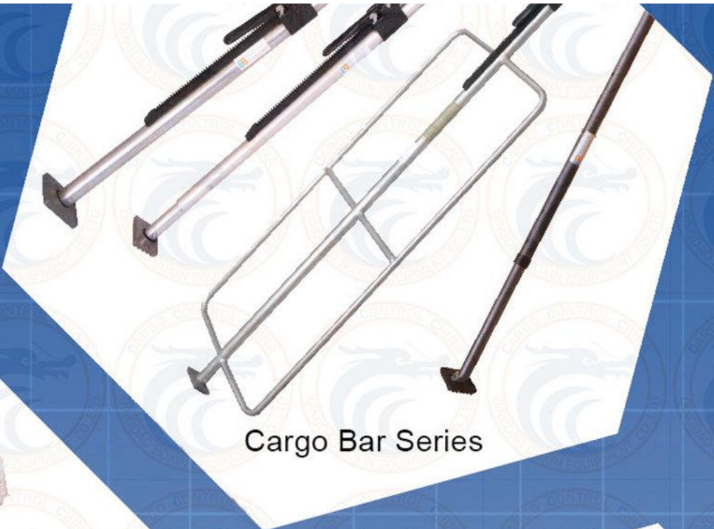
Cargo Bar Series