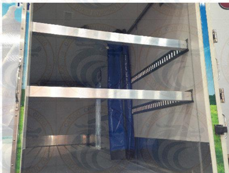
Decking Beam to Use