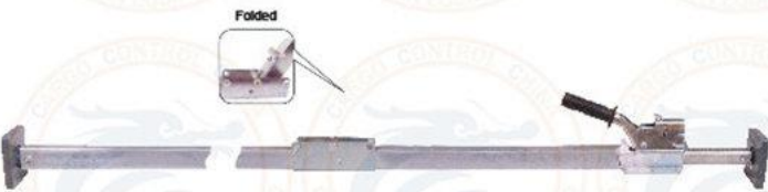
Folded Jack Bar w/Welded Square Tube and Bolt Foot Pads