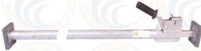
Jack Bar w/Welded Round Tube and Foot Pads