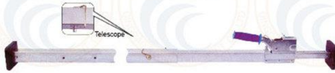
2 Pieces Telescope Jack Bar w/Welded Square Tube and Bolt on Foot Pads