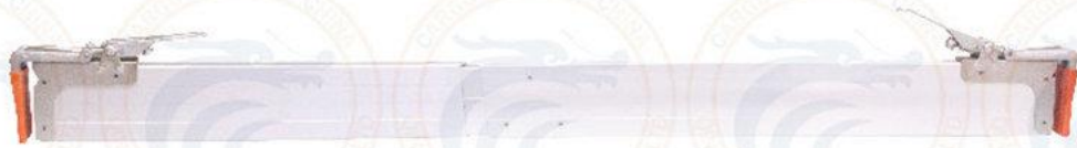
Parting Wall Lock with Casting Chuck