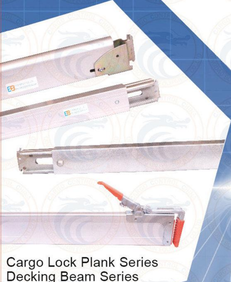
Cargo Lock Plank Series Decking Beam Series